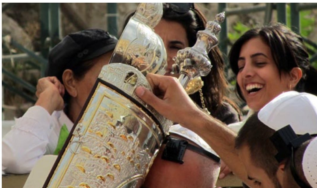
A bar-mitzvah at the Western Wall in Jerusalem

Every day we saw sections of the security wall that separates Israel from areas under Palestinian administration. About 4 or 5 metres high, surmounted by razor wire with guard towers at its corners, it gave Palestinian villages the unmistakable look of a prison. The only Palestinian area we visited was Bethlehem and the contrast between the quality of life on either side of the wall was obvious. Israel is a modern, clean, highly developed, efficient, and wealthy country. Palestine is not. This distinction was reinforced by the Israeli settlements on occupied land around Jerusalem. In my mind, I had been expecting small encampments. What we saw were instant cities of a dozen or more brand new apartment buildings. Most