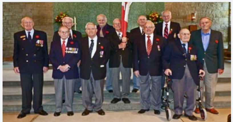
Remembrance Sunday, November 6th, 2011